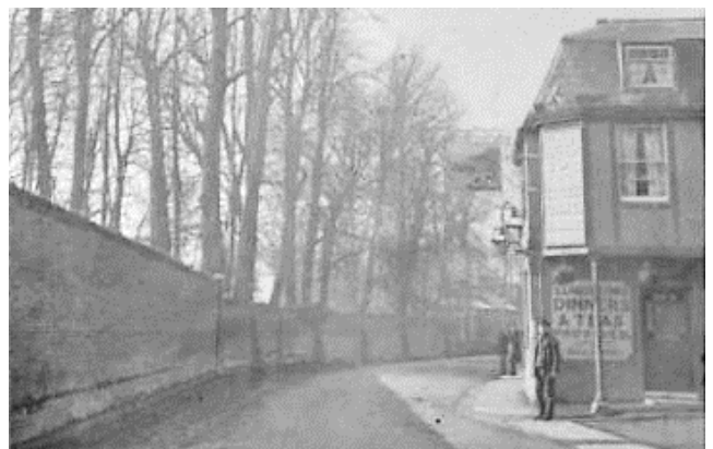
First floor billiards room and supporting iron post

The site dates from between c 1720 – 1740 when three cottages were grouped around a courtyard with stabling at the back. The pub began in the western-most cottage. It's thought that the death of the publican of the Greyhound and its temporary closure in 1756 may have been the spur for the Fox and Hounds to open. Carshalton at that time was a mecca for the sporting fraternity and