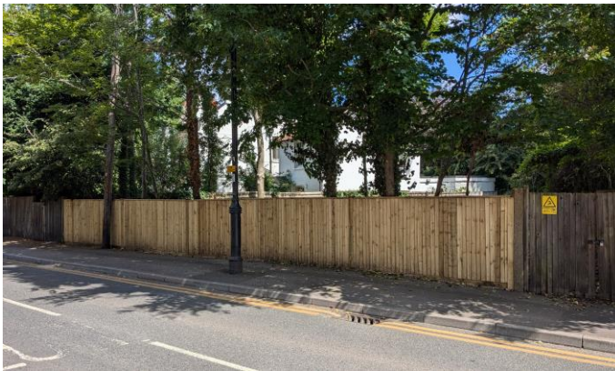
The new fence on West Street

Other news is that the plot of land at the rear of the Old Rectory - once part of the garden – has a new boundary fence facing West Street. Needless to say, we've been speculating about who owns this plot and their plans for it.