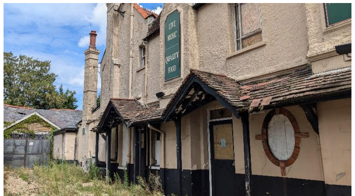
Fox & Hounds today