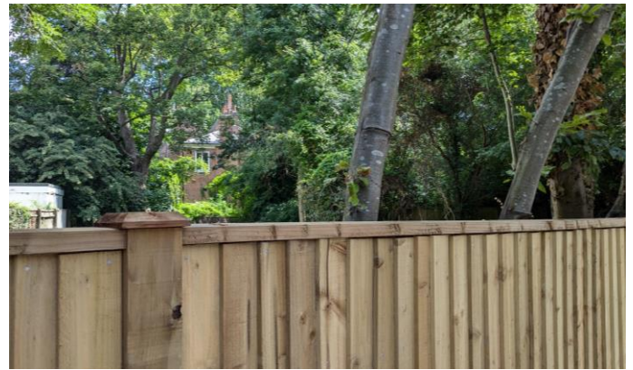
New fence with the Old Rectory in the background