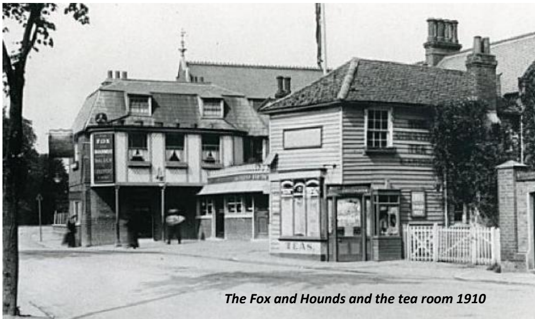
The Fox and Hounds and the tea room 1910